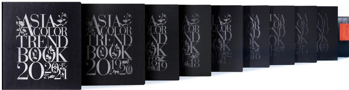
Current and previous editions of the Asia Color Trend Book

Tokyo, Japan —DIC Corporation announced today that on March 29, 2019, wholly owned subsidiary DIC Color Design, Inc., released the Asia Color Trend Book 2020–21. This is the 10th edition of this publication, which is the only design trend book in the world that focuses on trends in Asia.