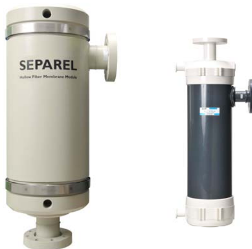
Large (10- and 6-inch) hollow fiber membrane decarbonation modules

At stand 03.115, the new product will be shown as part of DIC's SEPAREL ® series of hollow fiber membrane modules at AQUATECH AMSTERDAM 2017, a trade show for water industries, which will take place on 31 October to 3 November in Amsterdam. Sales are expected to begin in November 2017.