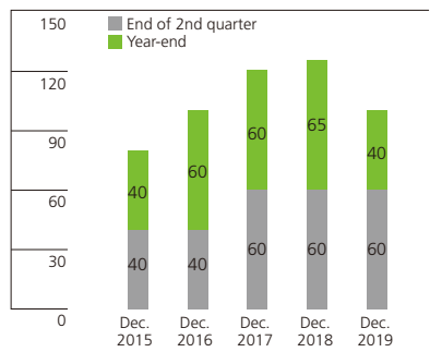
* These figures have been adjusted to account for the impact of a consolidation of shares of common stock by a factor of 10 to 1 with July 1, 2016, as the effective date.