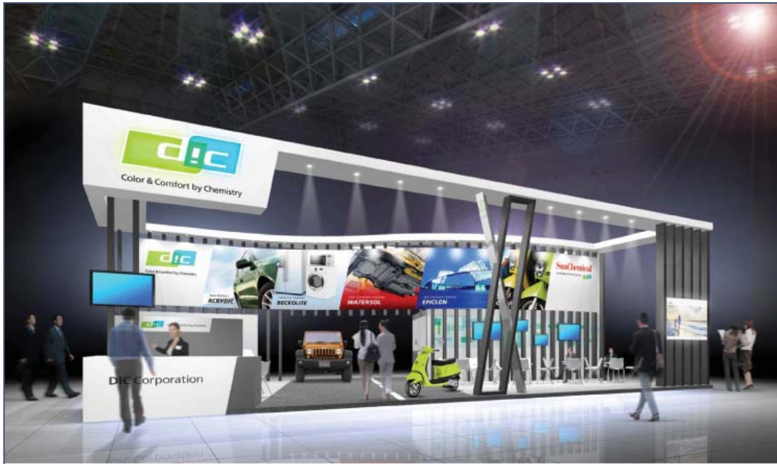
Artist's conception of the DIC Group's booth at Paint India 2016