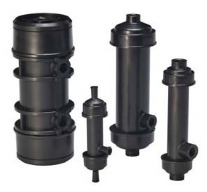
Hollow-fiber membrane modules for inkjet inks

Industrial inkjet printers, which are used widely in printing posters, outdoor signage and photograph, among others, incorporate degassing modules. Bubbles in inkjet inks can hamper ejection from nozzles, damaging print quality. Accordingly, removing bubbles is crucial, especially for applications requiring high definition.