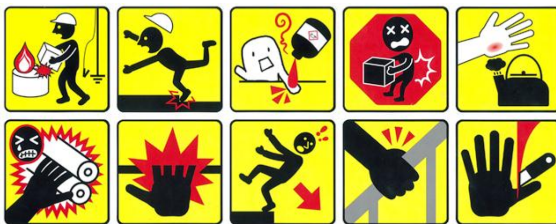
Warning stickers designed by DIC Group employees.

Looking ahead, the DIC Group will continue working as one to promote Responsible Care initiatives in line with its stated objective of achieving “zero accidents.”