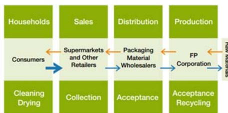
FPCO-method circular recycling

The properties of polystyrene mean that it can be easily converted back into its precursor, styrene monomer, using controlled thermal degradation, which makes it particularly suitable for the planned new recycling system. Because polystyrene made with chemically recycled styrene monomer delivers the same performance and safety levels as that made with petroleum-derived virgin raw material, there are no limits to potential applications.