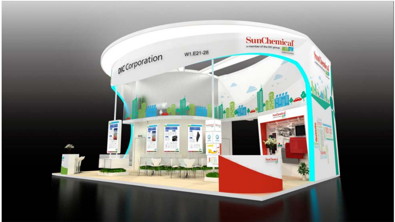
Artist's conception of the DIC Group's booth at CHINA COAT 2017