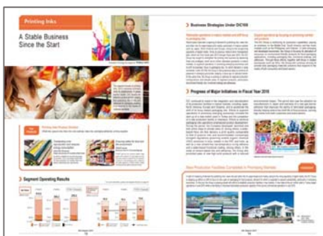
The report was designed in accordance with the principles of CUD

In preparing DIC Report 2017 , DIC referenced ISO 26000, the International Organization for Standardization’s standard for social responsibility, released in 2010, Japan’s Responsible Care Code; and the Global Reporting Initiative (GRI)’s G4 Sustainability Reporting Guidelines*. Having pledged to contribute through its business activities to the success of the United Nations (UN)’s 2030 Agenda for Sustainable Development, adopted in 2015 and later summarized as the Sustainable Development Goals (SDGs), DIC has also uses the official SDGs icons to identify pertinent DIC Group initiatives in the sustainability report portion of the report.