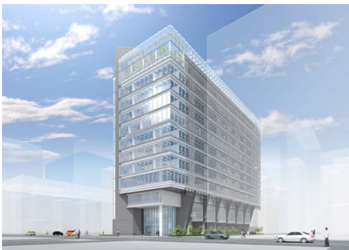
Artist's conception of DIC's new corporate headquarters