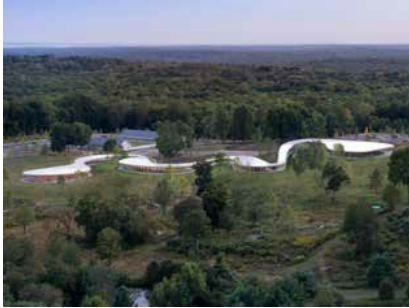
Grace Farms

Winner of major prizes including the Golden Lion at the 9th International Architecture Exhibition, La Biennale di Venezia, Italy (2004). Pritzker Architecture Prize, USA (2010). Praemium Imperiale in Honour of Prince Takamatsu, Japan (2022). Royal Gold Medal, Royal Institute of British Architecture, GB (2025).